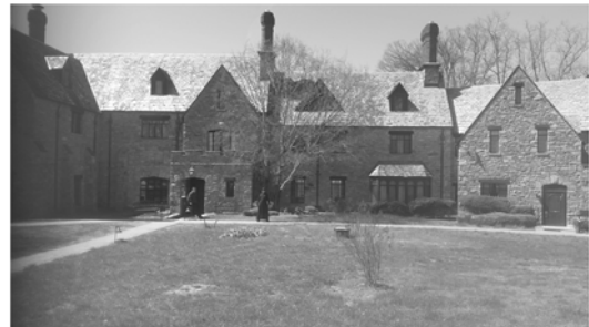
Longlea Conference Center, Boston, VA

For post-abortive healing, confidential help, & info call: Newark Respect Life Office (973) 497-4350 or via e-mail rileyche@rcan.org or www.Rachelsvineyard.org